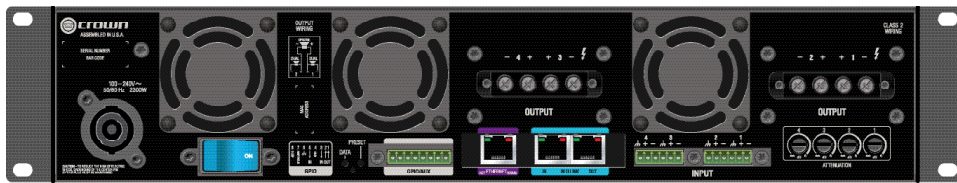
4|2400N model shown